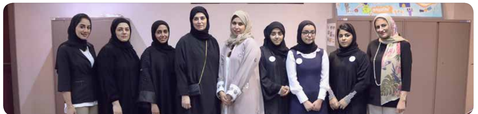
Bahrain Islamic Bank (BiB) hosted a group of female students enrolled under the Ministry of Education's training program "Takween"