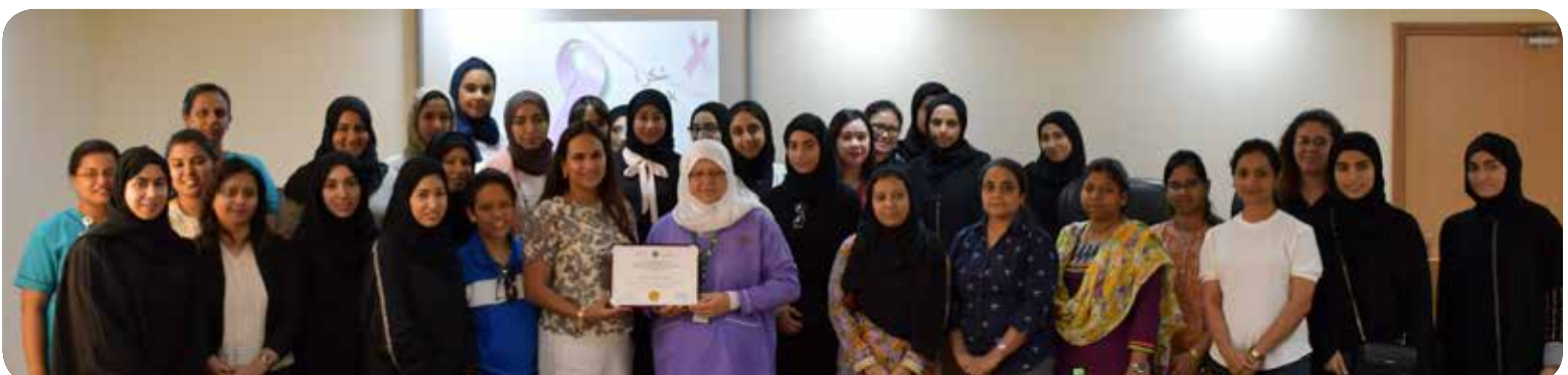
Almoayyed International Group organized a Breast Cancer Awareness Drive in association with American Mission Hospital at its headquarters in Sitra