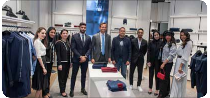
The Armani Group opened its new Emporio Armani store at the Bahrain City Centre mall