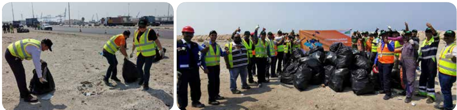
APM Terminals Bahrain joins international Port Operators in the global environment initiative 'Go Green'