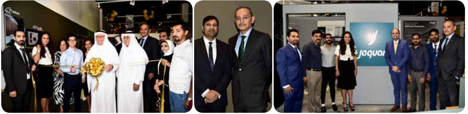
Designers Gallery, a part of the Almoayyed Contracting Group (ACG) opened its showroom in Tashan district