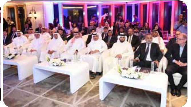
Bahrain's National Broadband Network (BNET) is Officially Launched during High Level Press Conference