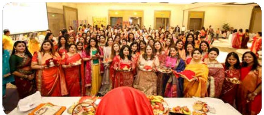
Punjabi's United in Bahrain (PUB) celebrated their annual Karwachuth Ceremony, an Indian festival which was attended by members and their families