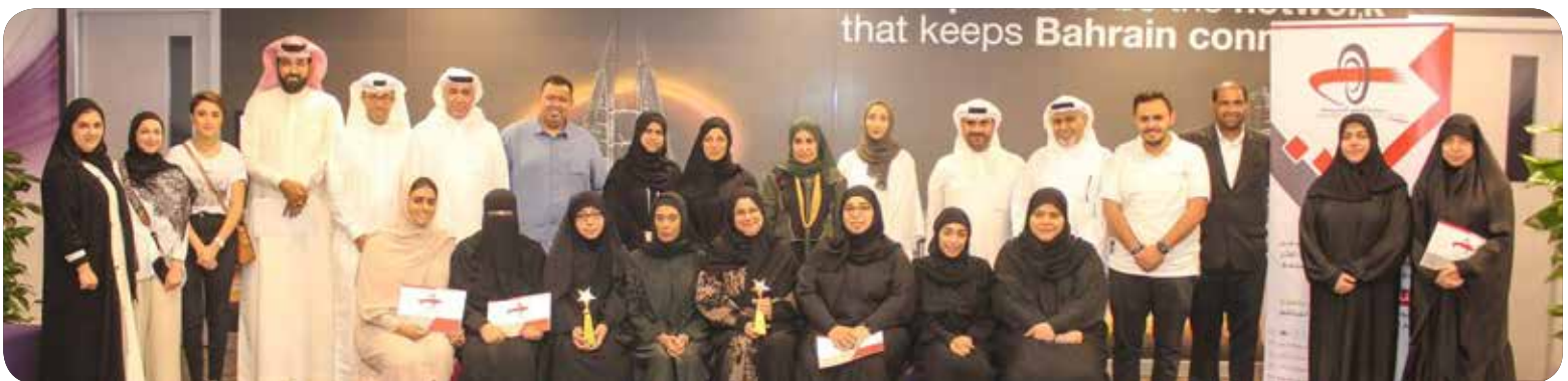
VIVA extends support to Bahrain Deaf Society for professional training course on sign language skills