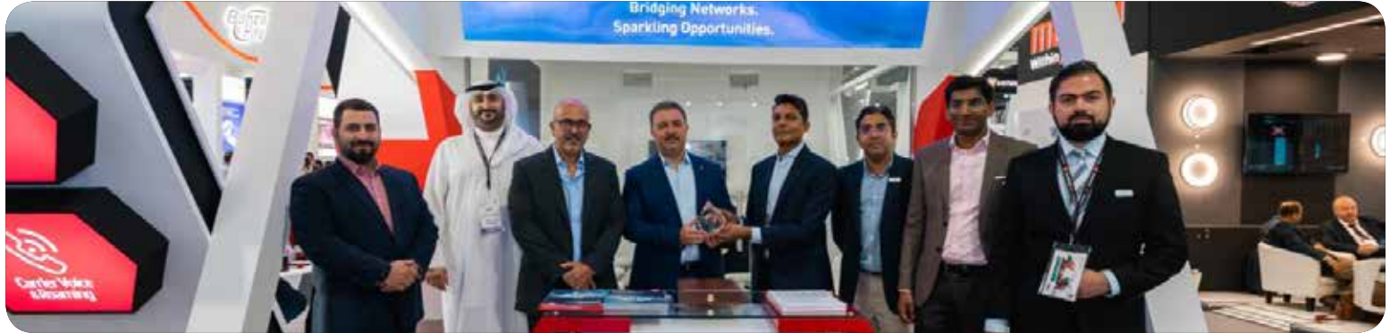
Batelco has been presented with the AVAYA 'Partner of the Year 2019' award by Weston group, a leading distributor of Avaya products, at GITEX 2019